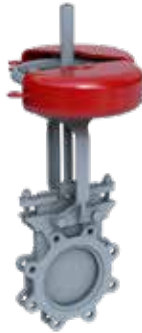
HANDWHEEL LOCK OUT