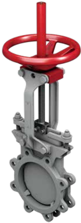
DIRECT MOUNTED HANDWHEEL