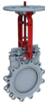
PINNED LOCKOUT OPEN & CLOSED