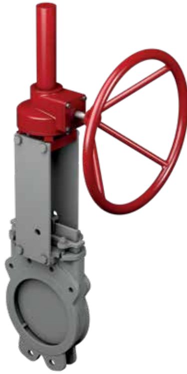
BEVEL GEAR OPERATOR