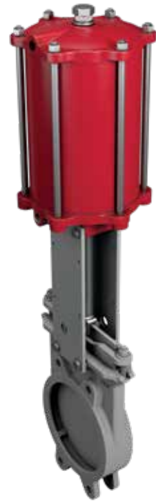
DOUBLE ACTING PNEUMATIC ACTUATOR