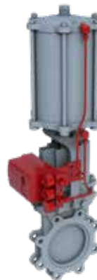
ELECTRO PNEUMATIC POSITIONER