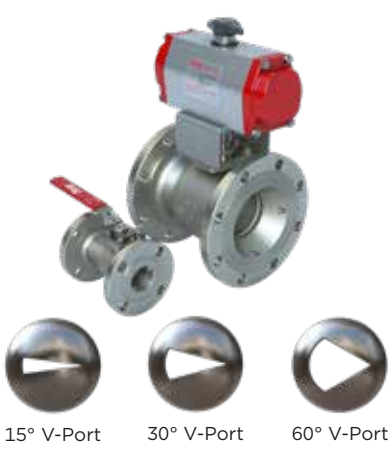
90° V-Port Custom Slotted Custom Flow