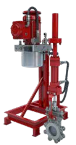
Custom Built Linear Actuators