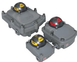
VALVE STATUS MONITORS Series 5A | 5B | 5C

Add to the versatility of the S98 by choosing the applicable accessories from Bray's complete line of positioners, status monitors and solenoids. The combination of actuators and accessories offer the best compatibility, economy and quality performance in the flow control industry.